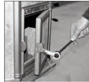
The fall-away handle may be used to operate the controls on your stove when they are too hot to handle safely.

The "fall-away" handle, which comes with your stove, can be used to operate the side door latch or the catalytic bypass damper. Simply insert the round knob end of the Fall-Away Handle into the door pull ring to open/close, or latch/unlatch the loading door. The loading door and the pull ring and the catalytic bypass handle are very hot, so use the tool provided. The "fall-away" handle conforms to UL requirements and is made so that if you let go of it, it will "fall-away" from the stove and not become too hot to handle.