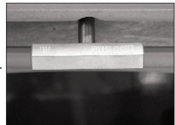
Use your bypass handle to engage or disengage your catalytic combustor. (Fig 1)