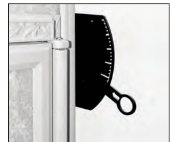
The amount of combustion air available in the firebox is controlled by the damper lever. (Fig 2)