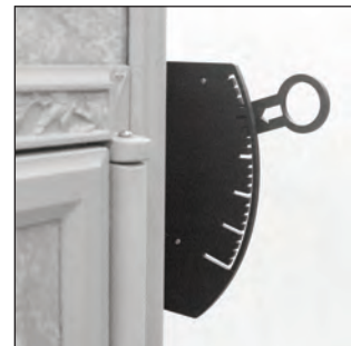
Lower Air Damper Setting (fig 3)

Never burn the stove with the air damper fully open except when kindling a fire or reloading the firebox.