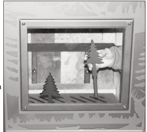
For easy access to the glass for cleaning, simply remove the two andirons by lifting up.

To clean the inside of the glass or wipe off fly ash, we recommend that you use a brush with soft bristles (like a paintbrush). A white vinegar and water solution works well to remove most ash or soot accumulation. You may clean heavy soot from the glass with very fine steel wool (0000 grade), but first, be sure the fire is out; and second, be sure that the glass has cooled to room temperature before you clean it. Once the glass is cool, you can lift out the two andirons to give you easier access to the glass. Once the glass is clean simply reinstall the andirons. DO NOT ATTEMPT TO CLEAN HOT GLASS.