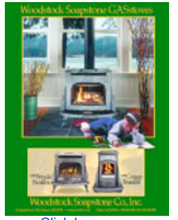
Click here to Download a pdf Gas Stove Brochure

Home • Photo Gallery • Free Catalog • Current Prices • How To Order • Support • Contact Back to Top