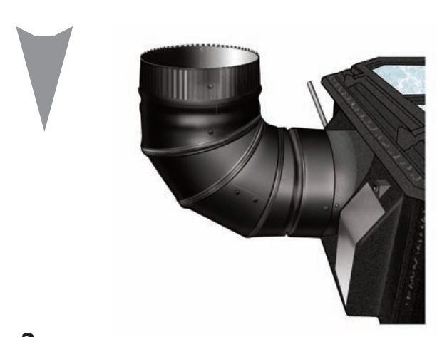
3. First piece of stovepipe will push over Appliance Adapter to meet flue collar. Screw stovepipe to Appliance adapter with sheet metal screws