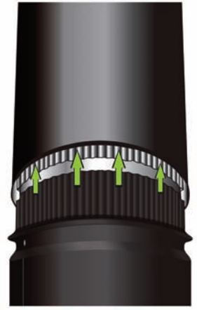
6. Outer crimped end fits between the two walls of the next piece of pipe and is secured with sheet metal screws.