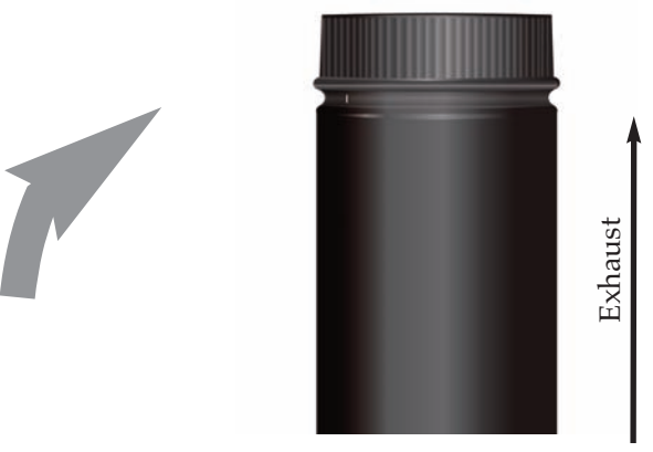
4. Outer crimped end of stovepipe should point away from flue collar on stove