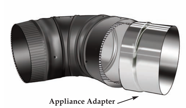
1. An Appliance Adapter (or reducer, in some instances) is required to attach Close Clearance pipe to the flue collar of the stove